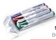
MARKER PENS BOARDMARKER